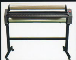
1. Insert Item